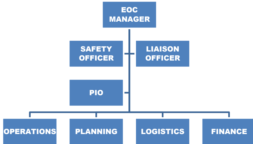
Figure 1 – EOC Incident Management Structure