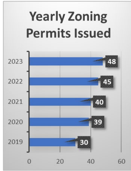
Zoning Permits Issued by Year