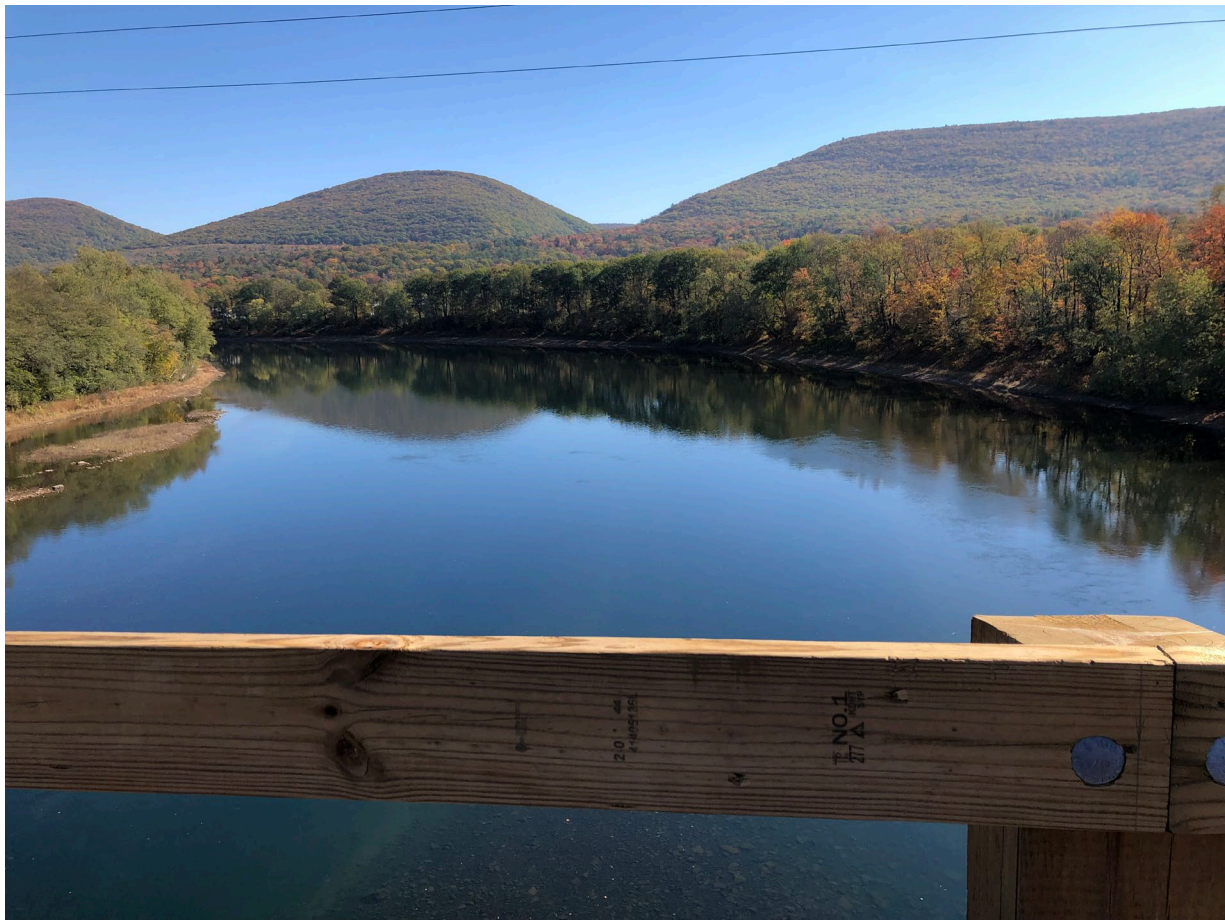
The view looking south from Katie’s Crossing, toward the river bend and Fort Horn.

The Clinton County Recreation Advisory Committee: The Clinton County Recreation Advisory Committee had a huge part in the planning and execution of several major events during the summer of 2023, such as the Happy Valley Ironman Triathlon Race, the 2023 Canoe and Kayak National Championships, and the Endless Mountains Adventure Race. For all three events, the members offered help by volunteering their time to help run and coordinate the races which spanned for several days and a vast area in Clinton County. The committee also went through a major reorganization which featured setting term limits for the respective members and revamping the bylaws of the committee. Currently there are two vacancies for the Clinton County Recreation Advisory Committee and we are accepting interest letters to fill the seats which are both one-year terms. There are several projects in the works for the year such as the Susquehanna River Campsite/River Trail system, The Beech Creek Boulder Park, and the Lockport Fish Ladder project which the group is creating “sub-committees” to offer aid to help with the completion of the projects.